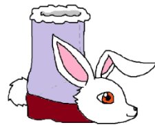
紫靴兔 Boot rabbit