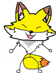
火柴狐 Match fox/